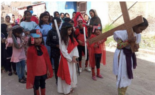
Simon Helps Jesus Carry His Cross