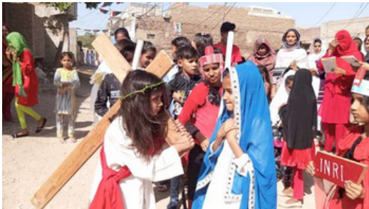
Jesus Meets His Mother