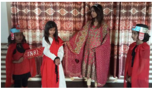
Jesus is Condemned to Death

During Holy Week, they reenacted the Stations of the Cross. They shared their photos of this moving event with us via Facebook. Here are a few: